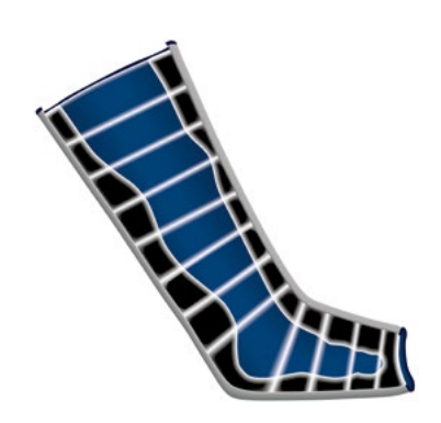
Twelve Overlapping Chambers