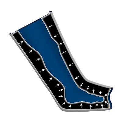
Consistent Inward Pressure

Overlapping internal chambers eliminate uncomfortable 'pinch points'.