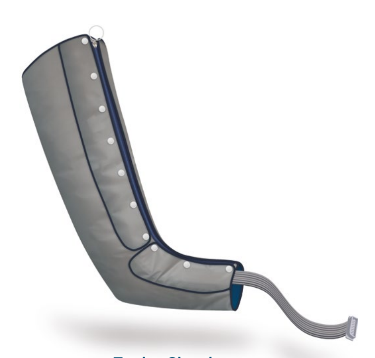
Twelve Chamber Leg Garment