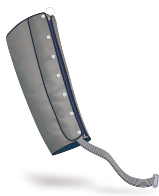
Twelve Chamber Arm Garment

Clinical evidence - Intermittent Pneumatic Compression (IPC) and Manual Lymph Drainage provides a synergistic enhancement of the effect of Complex Decongestive Physiotherapy (CDP).